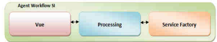
Fig.3 IS Workflow Agent Architecture

submitted by the user about an IS component given and published in the IS Connection server .